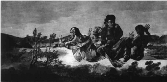
The Fates by Francisco de Goya.

In the Classical world, Romans and Greeks associated the concept of fate with some idea of the natural order of things, an order to which all gods and men were subject. Most essentially, however, fate was one's "lot" or "portion," one's moira , in Greek. For mortals, the universal fate was death. The Moirai were cult deities who helped to bring good or bad fortune on men. Of course, Zeus was the ultimate master of these figures. Roman culture took in the idea of three immortals, called the Parcae or Fata , who wove and sung peoples' destinies.